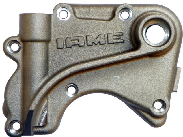
Old version Vieille version