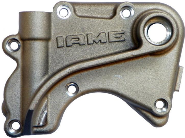
Old version Vieille version